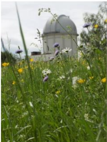
"Colorful Meadow" at the Planetenweg in Tübingen

By the way, partner initiatives can be found in the cities of Berlin, Landau, Potsdam, Quakenbrück, Stuttgart, and Würzburg!